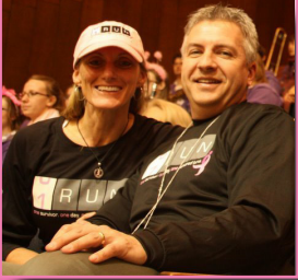
View more photos